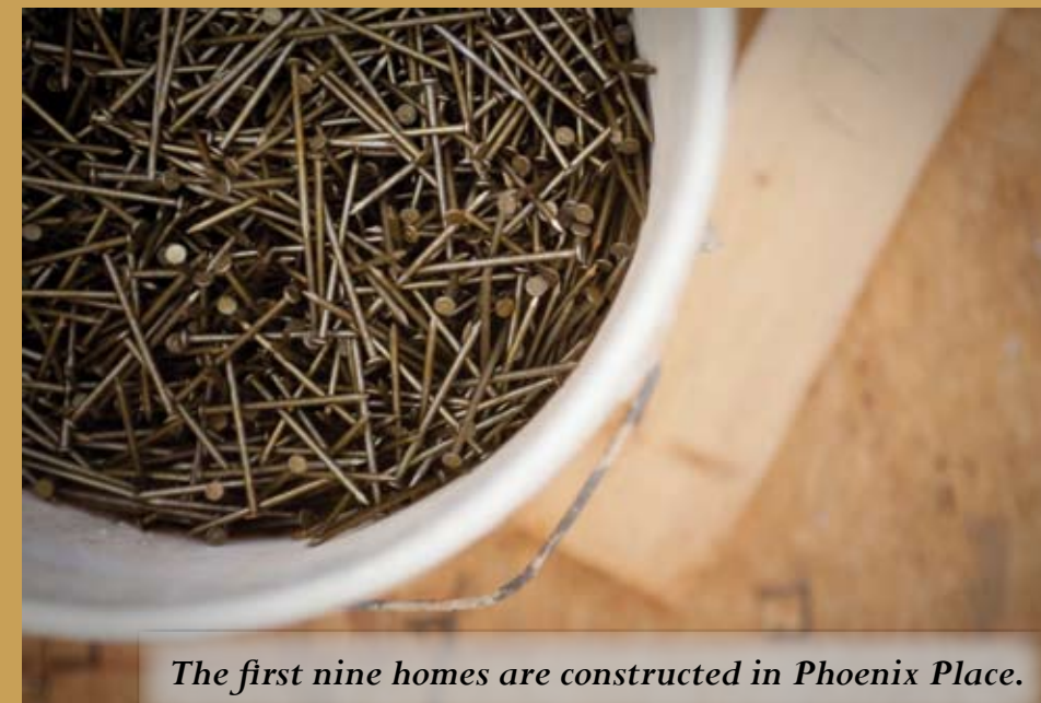
The first nine homes are constructed in Phoenix Place.