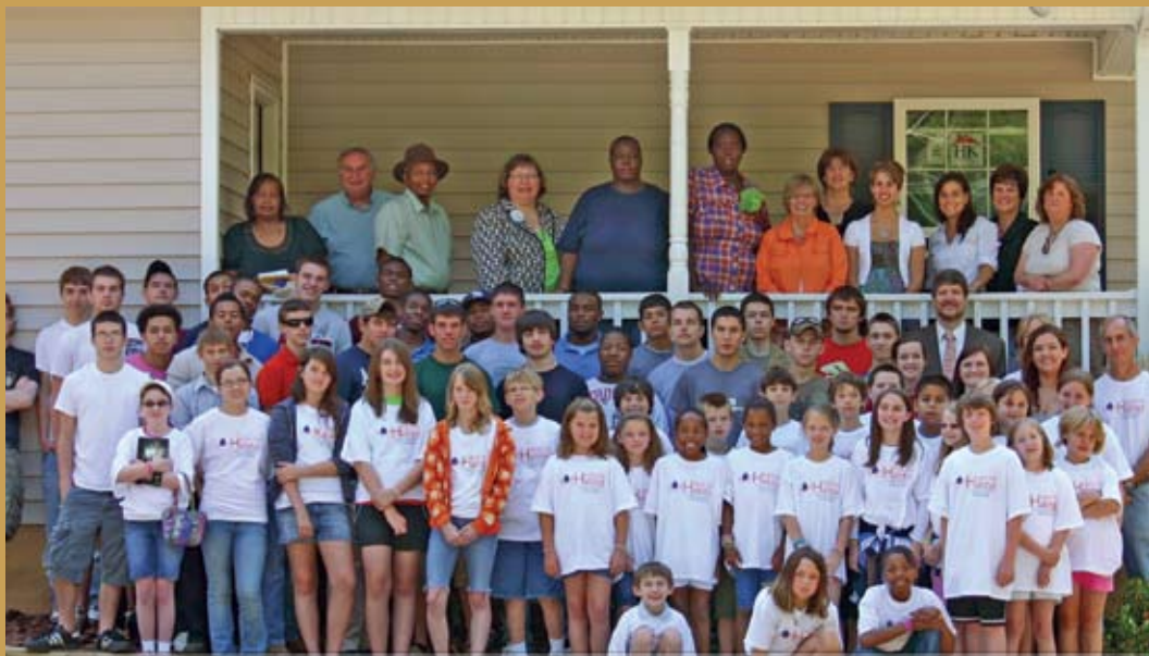
Orange County Schools dedicates the first Hands for Habitat home.